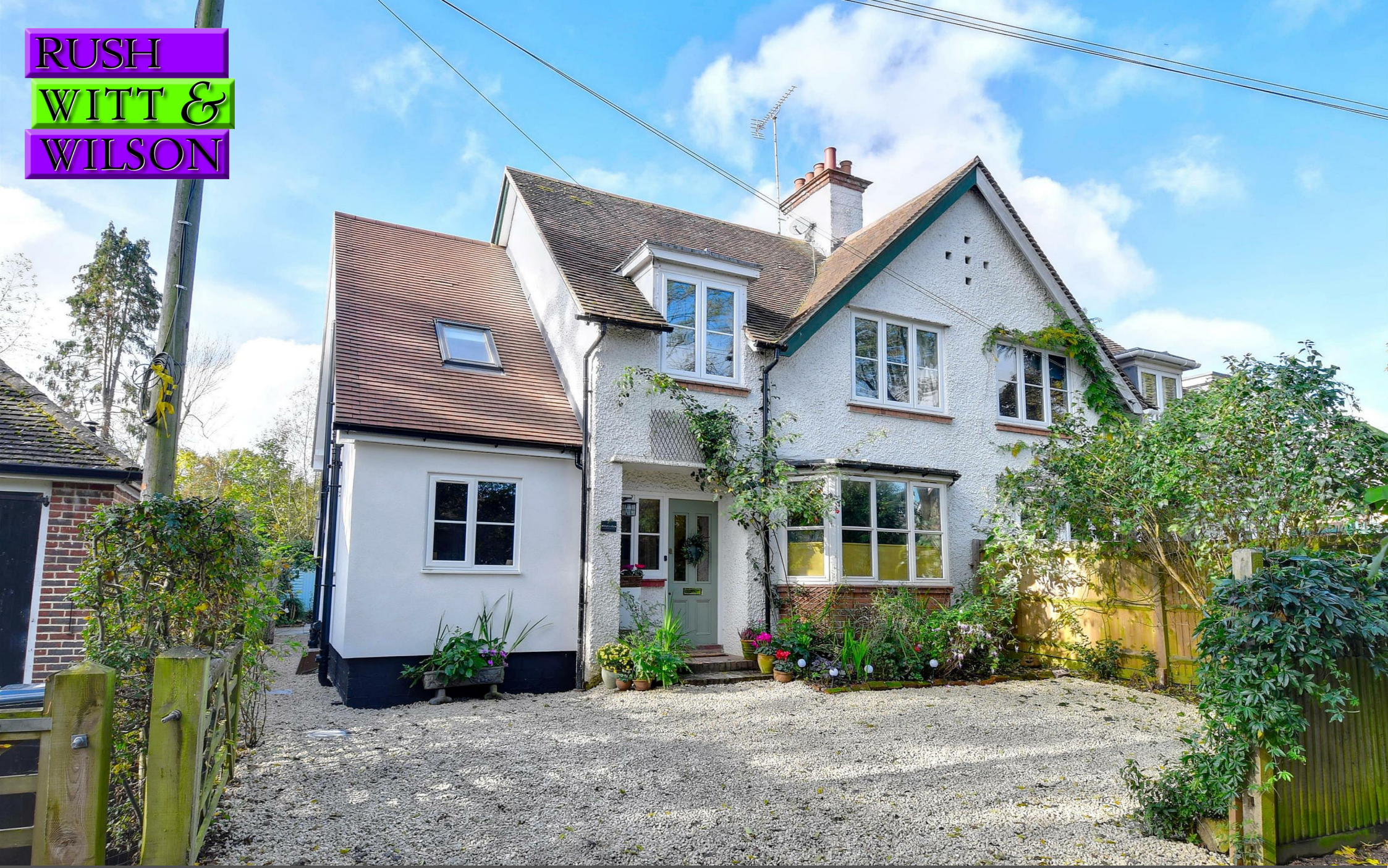
Maryville Causton Road, Cranbrook, Kent TN17 3ER Guide Price £700,000 - £725,000